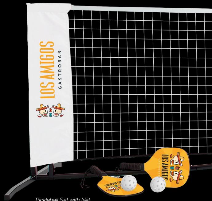
Pickleball Set with Net