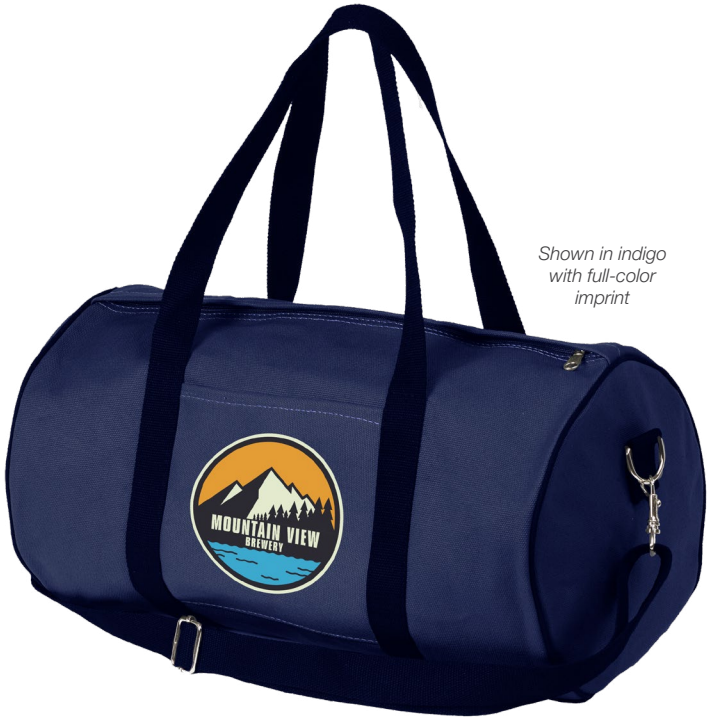
Shown in indigo with full-color imprint

Full-Color Imprint Production Lead Time: 5 days from final proof approval Embroidery Production Lead Time: 10 days from final proof approval