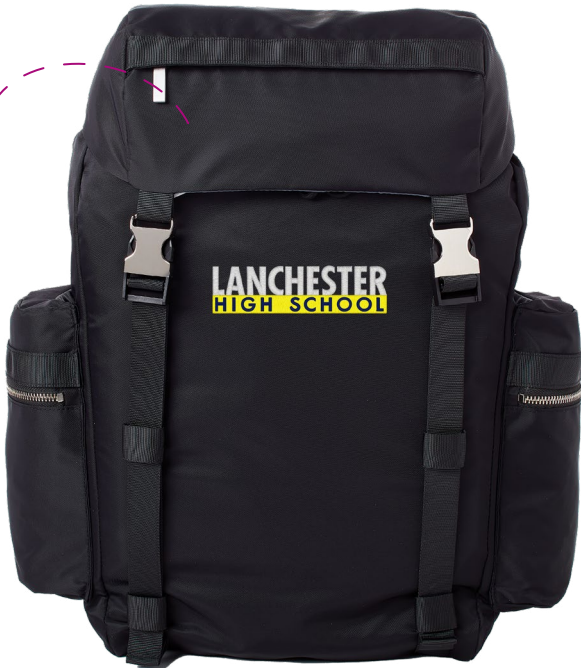
Shown with embroidery

Extra-wide opening with drawstring and deep front pocket with snap closure.