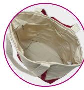
Expandable zipper top.