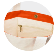
Shown in natural/pumpkin with full-color imprint

Includes a secure magnetic closure and an inside zipper pocket.