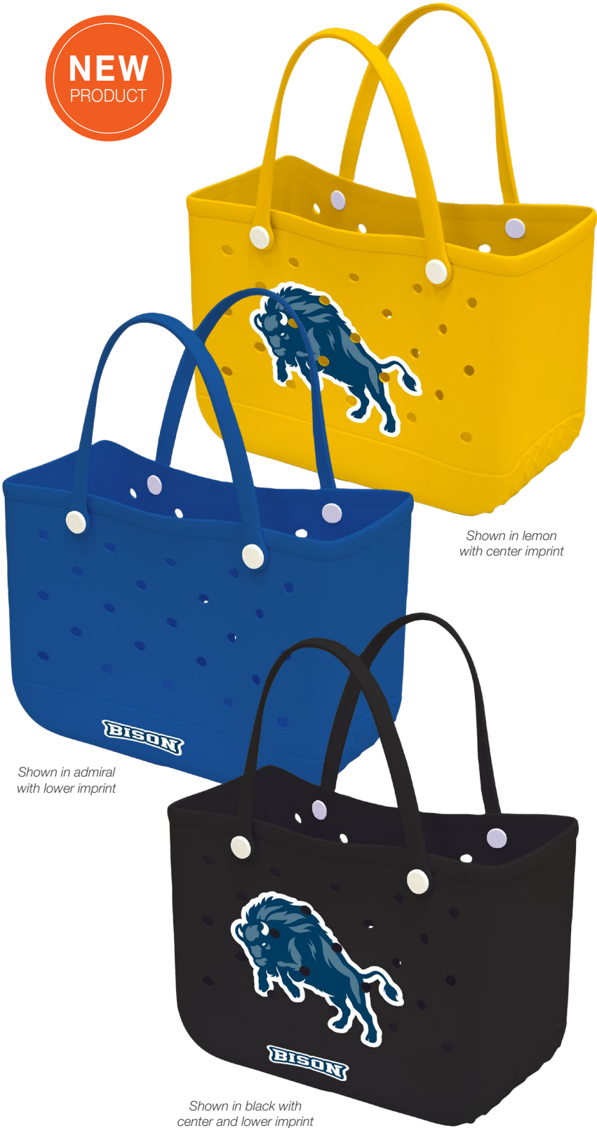
Shown in lemon with center imprint