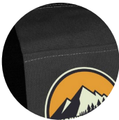
Duffel has an outside pocket.