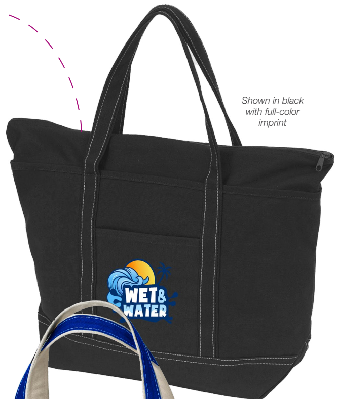
Shown in black with full-color imprint