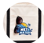
Includes a front exterior pocket.

PMS colors are for reference only and may vary slightly from actual color.