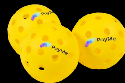
Indoor/Outdoor Pickleball Balls

did you know WE SELL THESE PICKLEBALL PRODUCTS TOO?