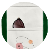
Features a front exterior pocket.