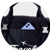
Includes an extra deep side compartment and small exterior pockets for storage.