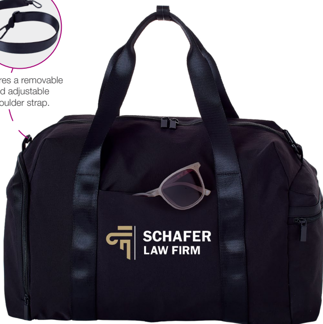
Shown with full-color imprint

Features a removable and adjustable shoulder strap.