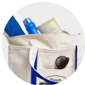
Expandable zipper top.