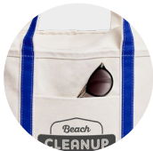
Includes a front exterior pocket.