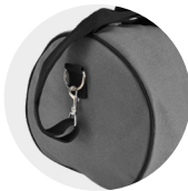
Features a removable and adjustable shoulder strap with swivel hooks.

From workouts to weekend getaways, this bag keeps you organized and on-the-go in effortless style. Constructed of water-repellent rPET polyester with a recycled neutral gray polyester lining Features a 13" exterior padded laptop pocket with zippered closure Easy-carry handles with a snap closure and removable shoulder strap Attaches to luggage with luggage sleeve for easy travel Available with vibrant full-color imprint or embroidery Minimum order quantity of six for full-color imprint; 12 for embroidery Duffel has a 1-year warranty Embroidery is not eligible for Rush Service