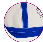
Handles and trim are color-matched for a cohesive look.