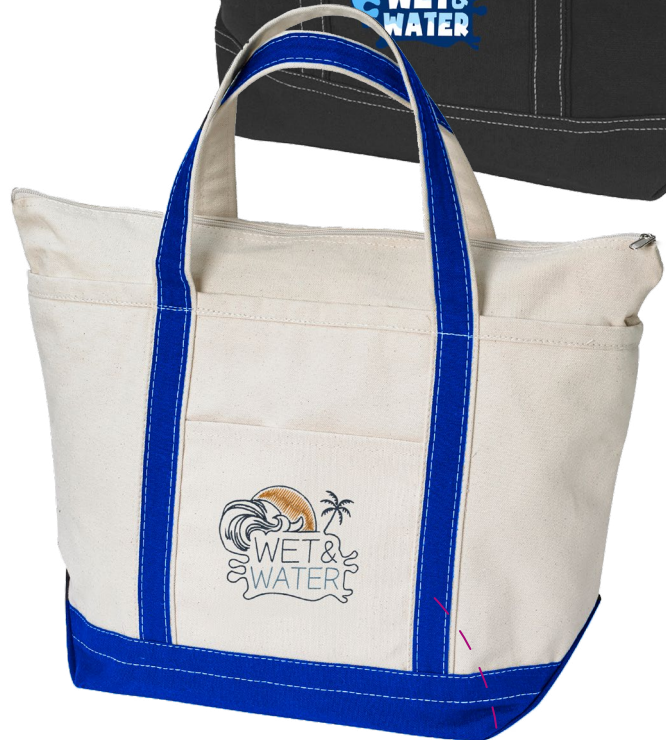
Shown in natural/azure with embroidery