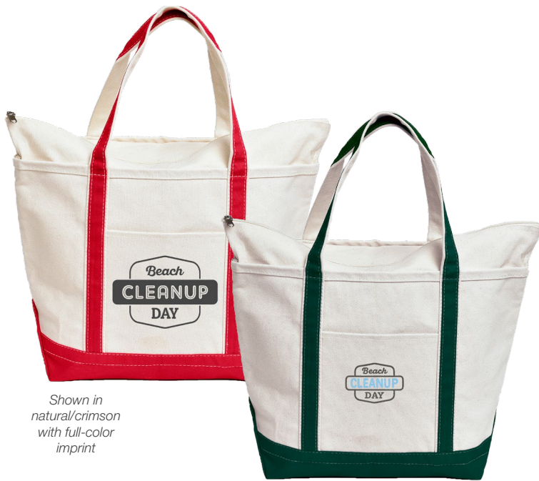
Shown in natural/crimson with full-color imprint