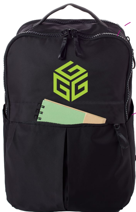
Shown with full-color imprint

Full-Color Imprint Production Lead Time: 5 days from final proof approval Embroidery Production Lead Time: 10 days from final proof approval