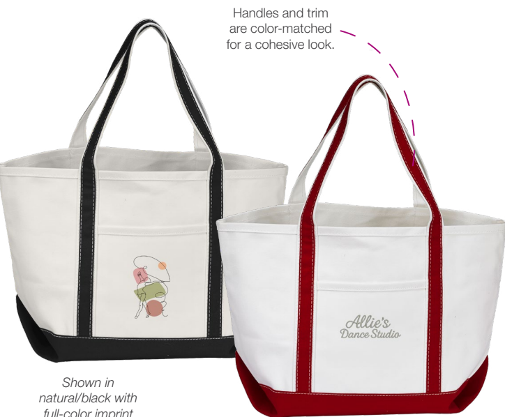
Handles and trim are color-matched for a cohesive look.

PMS colors are for reference only and may vary slightly from actual color.