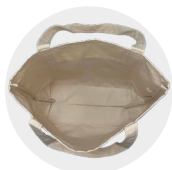
Open top design for quick access.