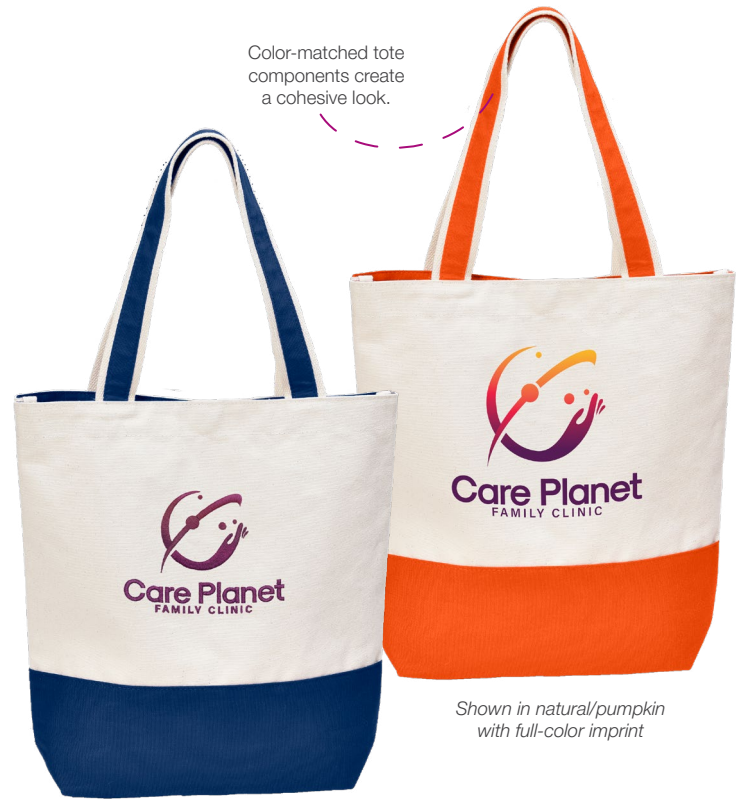
Shown in natural/indigo with embroidery

Color-matched tote components create a cohesive look.